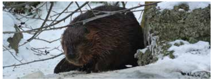
Ward the beaver, a genetics pioneer. Sequencing his genome will help SickKids researchers identify mutations in the human genome.

What's equally important is the kind of sequencing they did on Ward.