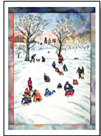
“Winter Day” by Alice Brickner 5 x 7 inches