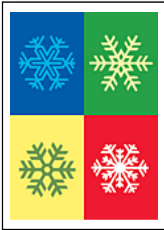
“Four Snowflakes” by Dana Mardaga 5 x 7 inches