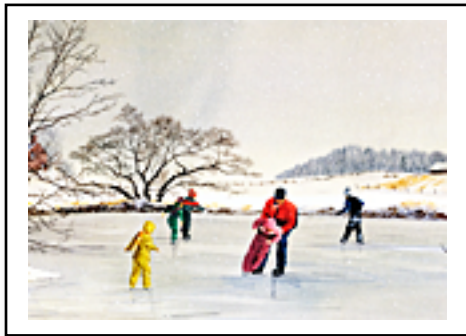
“The Skaters” by Alan Kingsland 7 x 5 inches