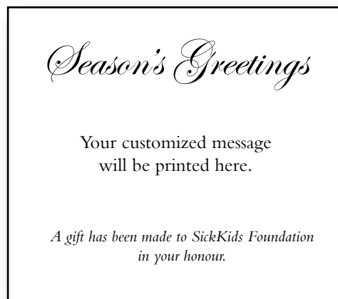
Text Option B