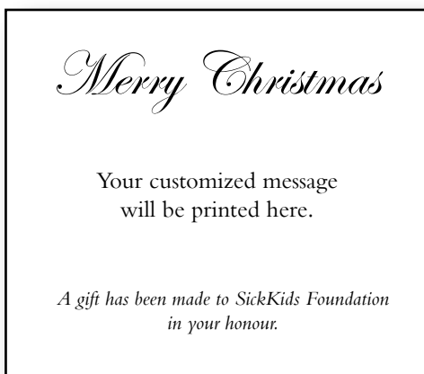
Text Option C