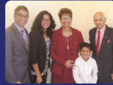
The de Souza family